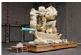
Paul McCarthy Ship of Fools, Ship Adrift 2 | 2010 Courtesy the artist and Hauser & Wirth This project was made possible through the generous support of the Anita and Luca Belgiorno-Nettis Foundation

Paul McCarthy, one of the most influential and provocative artists in the United States today, has spent much of his career critiquing and exploring western society’s obsessions – its mass media, popular culture, and icons of its consumer, entertainment and art industries. In reaction to the excesses of consumer capitalism, ‘Disneyfied’ banality and misplaced feelings of entitlement, McCarthy has developed a subversive vocabulary that twists, perverts and exaggerates the world around him to a heightened and crazed state. A new sculpture by McCarthy premieres at Pier 2/3, Walsh Bay. Ship of Fools, Ship Adrift 2 (2010) is a contemporary rephrasing of the medieval allegory, depicting a world of power without principle as the ship and its denizens hurtle obliviously towards their own destruction. Constructed from foam, the child-like faces of the caricatured inhabitants float dumbly above the ship that sports an implausible gun barrel mounted on its prow.